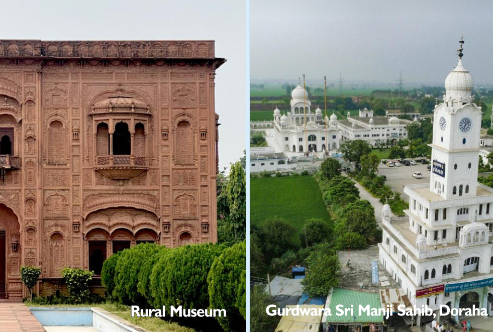
Gurdwara Sri Manji Sahib, Doraha

The Qila at Payal was built by Maharaja Amar Singh of Patiala with the co-operation of Mughals in 1771 AD. It is 4.5 kms from the national highway and 7.5 kms from the settlement of Doraha. The Qila is of high Architectural significance and is a State Protected Monument under "The Punjab Ancient & Historical Monuments & Archaeological sites & remains Act, 1964.