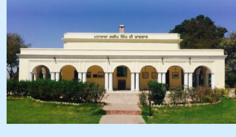
Maharaja Duleep Singh Memorial (Raikot)

This existing structure of Bassian Kothi served as the temporary lodge of Last Maharaja of Punjab, "Maharaja Duleep Singh" son of Sher-e-Punjab Maharaja Ranjit Singh in the year 1850 before he was exiled to Britain. At this place, five revolutionaries of Namdhari sect, who were participated in Kuka movement also imprisoned. This museum dedicated to the life of "Maharaja Duleep Singh" where replica of his belongings are being kept.