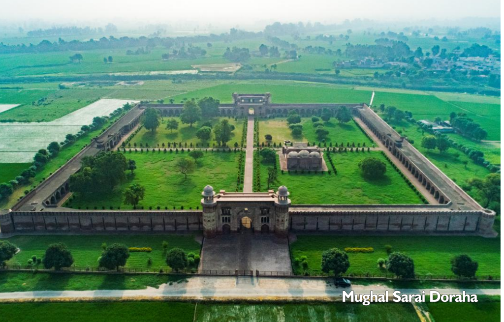
Mughal Sarai Doraha

The Sarai is approximately a 168 sqm square enclosure of battlement walls with octagonal bastions at each corner. There are imposing gateways on the northern and southern sides. The northern gate has some remains of floral designs while the southern gate has paintings of flora and fauna. Both gates are connected with a kachna (unmetalled) gateway. The northern and southern sides of the Sarai have 20 rooms each, whereas the eastern and western sides have 30 rooms each with a suite of three rooms in the centre. On the north-east corner of the Sarai, there are some rooms which might have been a 'hamman' (bathroom). Access to the hamman is through a barrel-vaulted corridor. Many rooms have ceilings specially designed for light and ventilation. The walls and ceilings of these rooms were richly painted with designs executed in bright colours, traces of which are still visible.