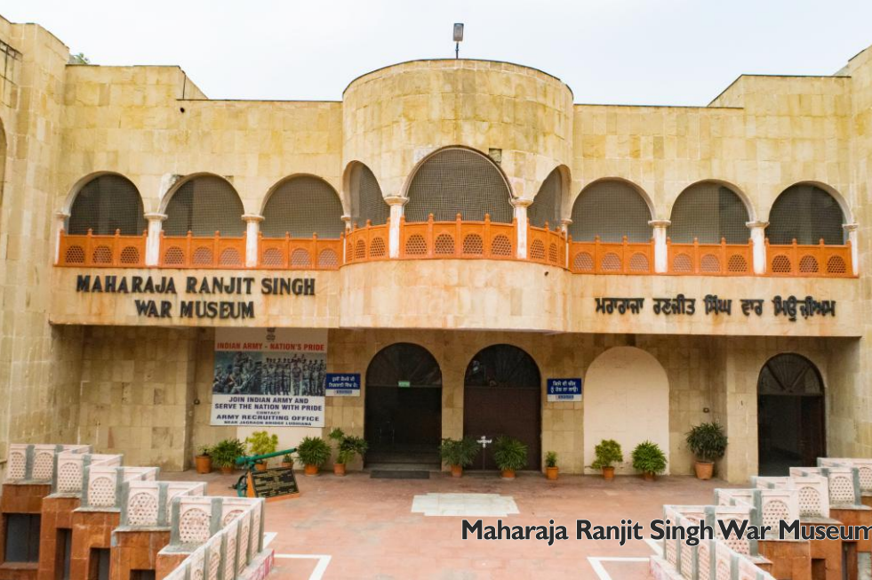
Maharaja Ranjit Singh War Museum